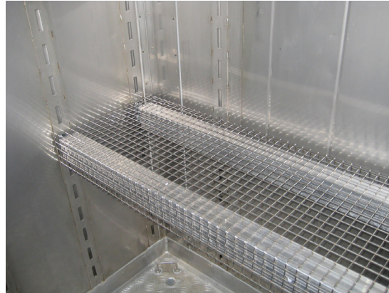
This item can be used to support cargo in Canadian Tricon Refrigerated System