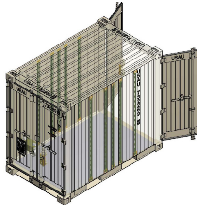
(4) Quadcon Containers coupled together to form (1) 20' ISO Module