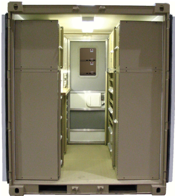
Interior Door Panel Insert in WORKSHOP configuration