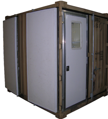
Half Door Insert Panel