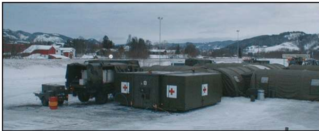
Shelter deployed as a Mobile Field Hospital