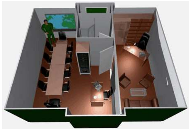
Shelter in an Office/Command Center configuration