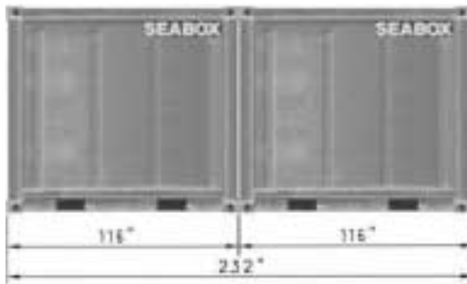
Designed to fit inside of a 20' x 8'6" ISO Container

Matches the outside base of a 20' ISO Container