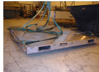
ECDS Pallet is sling loadable and designed for suspended air drops.