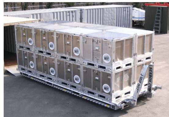
(16) J-MICs be can locked on a J-MIP