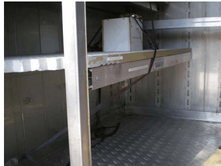
Front to Back Length (MEDIUM): 77.5