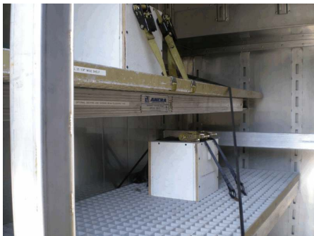
Front to Back Length (SHORT): 70"