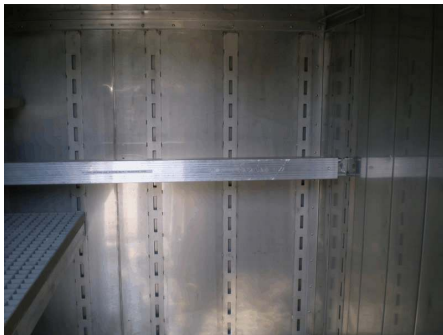
Side to Side Length: 71.5"