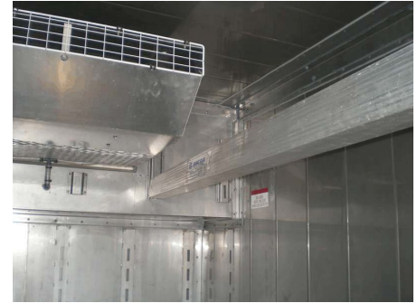
Front to Back Length (LONG): 87"