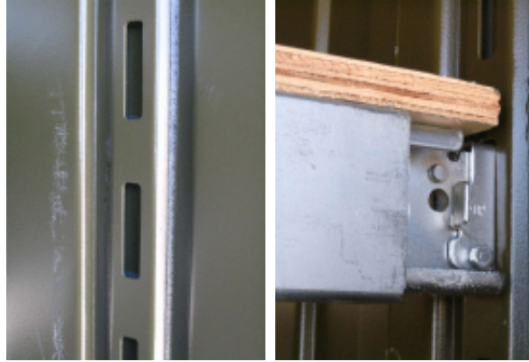
Shoring & Decking Beam engages on vertical "E" track system on ISO Container wall