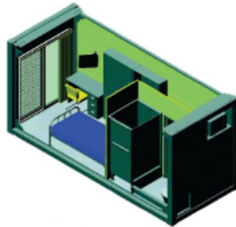
INTERNAL ARRANGEMENT - SIDE ISOMETRIC VIEW