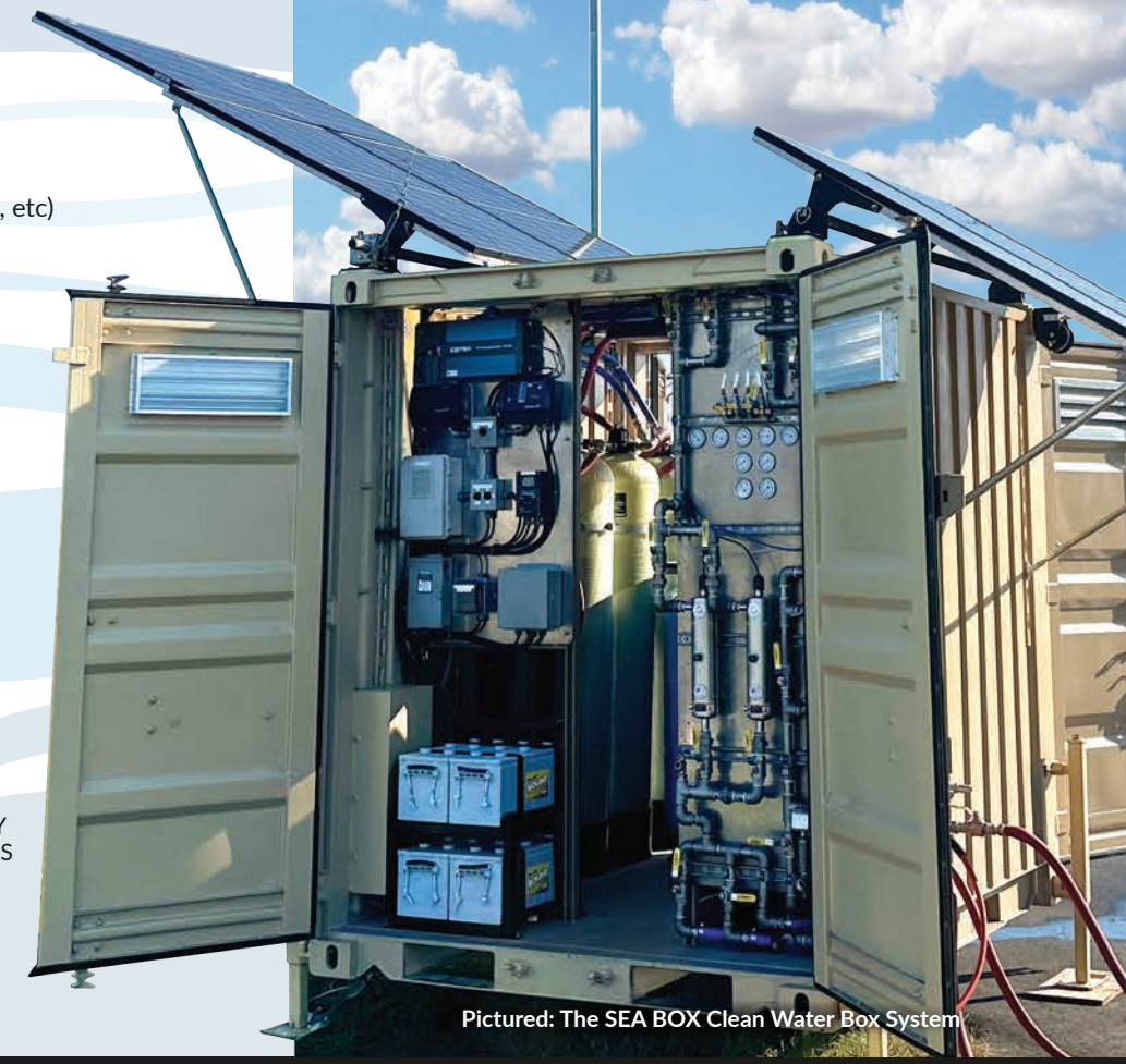
Pictured: The SEA BOX Clean Water Box System

* Quantity and quality of the water produced by the Clean Water Box will vary based on conditions. Due to varying conditions quantity and quality results are not guaranteed.